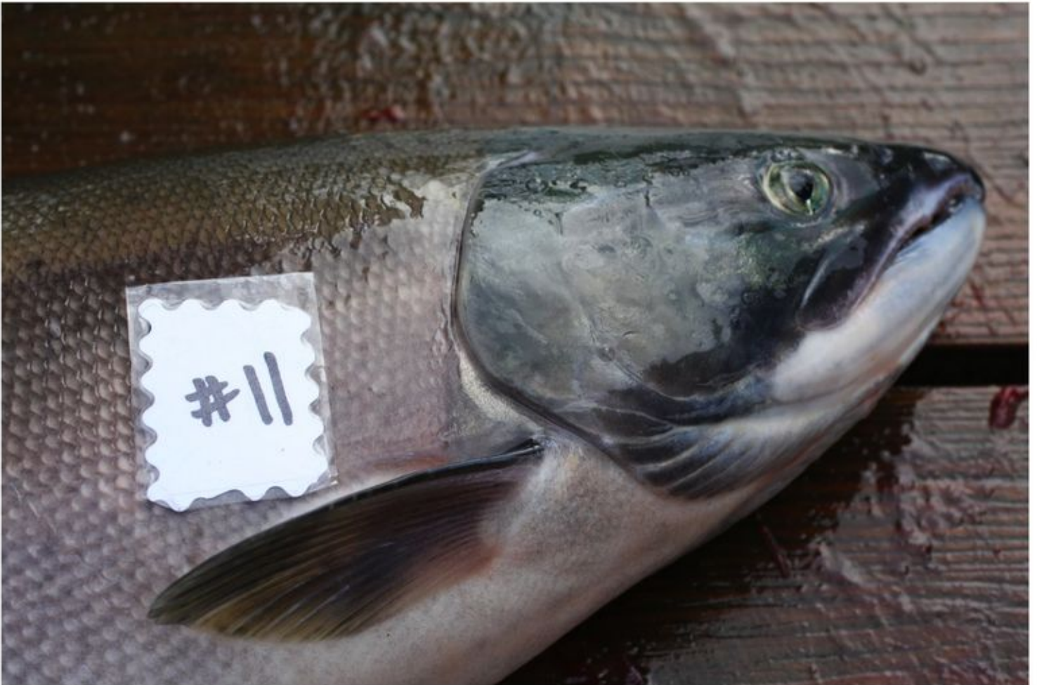
Harrison White Spring with ISA virus

Fraser Coho infected with European ISA virus